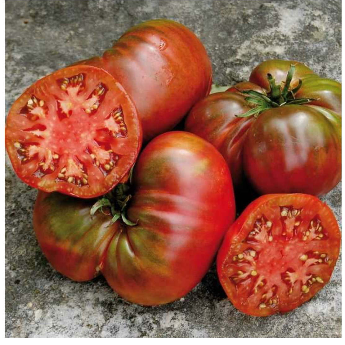
TM399-20 - Black Sea Man Tomato