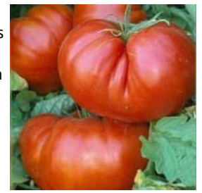
TM147-20 - German Pink Tomato

80 days. Solanum lycopersicum. Open Pollinated. The plant produces good yields of 12 to 24 oz dark pinkish-red beefsteak tomatoes. They are very sweet, meaty, juicy, and flavorful. Low acidity variety. A potato leaf variety. Crack Resistant. An excellent choice for home gardens. An heirloom variety from North Carolina and Virginia, USA. Indeterminate.