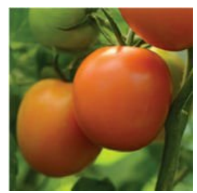
TM176-20 - Peron Tomato

70 days. Solanum lycopersicum. (F1) Perfect Flame Tomato. This early maturing plant produces good yields of 3 to 4 oz orange tomatoes. It has a sweet and tart flavor that is perfect for salads. This is a cross between the Peron Tomato and Flamme Tomato. The tall plant requires staking and produces tomatoes over a longer time. Instead of having one large harvest at once, they bear for months. Excellent choice for home gardens and greenhouse production. Indeterminate.