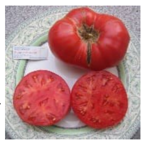
TM471-20 - Stupice Tomato

80 days. Solanum lycopersicum. Open Pollinated. Stump of the World Tomato. The plant produces good yields of 1 lb dark pink beefsteak tomatoes. They are very sweet, meaty, juicy, and flavorful. It has a rich old fashioned tomato flavor. They are as flavorful as a Brandywine but more productive. One of the very best tasting tomatoes. Perfect for salads, slicing, and sandwiches. A potato leaf variety. An excellent choice for home gardens. An heirloom variety from the USA. Indeterminate.