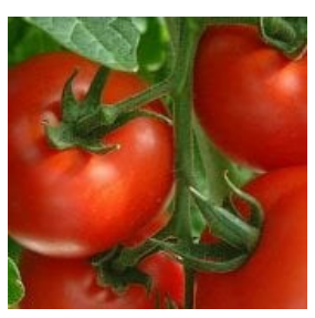
TM546-10 - John Baer Tomato

64 days. Solanum lycopersicum. (F1) Jetsetter Tomato. This early maturing plant produces high yields of 8 oz red tomatoes. They are very sweet, juicy, and flavorful with a rich old-fashioned tomato flavor. Perfect for sandwiches, salads, and slicing. This variety matures very early offering those in the South a great early harvest. It is one of the most disease resistant tomato varieties available. The type is seen in the fresh vegetable aisle of supermarkets! An excellent choice for home gardens, farmer's markets, market growers, open production, and commercial production. Disease Resistant: V, FF, N, A, St, TMV. Indeterminate.