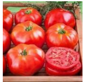
TM762-10 - Carmello Tomato Seeds

85 days. Solanum lycopersicum. Open Pollinated. Caribe Tomato. The plant produces good yields of 8 oz red tomatoes. Perfect for sandwiches, salads, and slicing. Does well in humid regions. Good shipping variety. Suitable for container gardening. An excellent choice for home gardens and market growers. Disease Resistant: V, FF, A. Determinate.