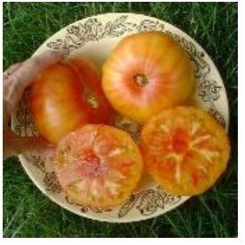
TM763-20 - Pink Berkeley Tie Dye Tomato Seeds

85 days. Solanum lycopersicum. Open Pollinated. Pineapple Tomato. The plant produces high yields of 2 lb bicolored yellow beefsteak tomatoes with red streaks both on the outside and inside. They are very sweet, meaty, juicy, and flavorful. It has a rich old-fashioned tomato flavor. Perfect for salads, slicing, and sandwiches. The plant has good foliage protecting tomatoes from sun-scald. An excellent choice for home gardens. An heirloom variety from the USA. Indeterminate.