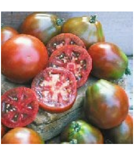
TM887-10 - Jasper Tomato

75 days. Solanum lycopersicum. Open Pollinated. Japanese Black Trifele Tomato. The plant produces high yields of 4 to 6 oz mahogany tomatoes. It is one of the best tasting black tomatoes from Russia. It has a rich old fashioned tomato flavor. They are very sweet, meaty, juicy, and flavorful. Perfect for sandwiches, salads, slicing, and canning. The attractive tomatoes are the shape and size of a Bartlett pear. A potato leaf variety. Crack Resistant. A heirloom variety from Russia. Indeterminate.