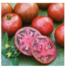
TM116-20 - Black Russian Tomato

70 days. Solanum lycopersicum. Open Pollinated. Black Prince Tomato. This early plant produces high yields of 3 to 6 oz reddish black tomatoes. It has a rich old fashioned tomato flavor. They are very juicy and flavorful. Perfect for eating fresh right off the vine, for sandwiches, salads, slicing, canning, and making the sauce. This old Russian heirloom has become very popular in gourmet restaurants. Sets fruit in cool climates. It is very productive yielding from 25 to 40 pounds of tomatoes per plant. The plant requires support, either staking or cages. Cold Tolerant. An excellent choice for home gardens and specialty market growers. An heirloom variety from Irkutsk, Siberia, Russia. Indeterminate.