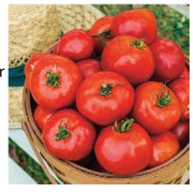
TM913-10 - Celebrity Plus Tomato Seeds

72 days. Solanum lycopersicum. (F1) Celebration Tomato. This early maturing plant produces heavy yields of attractive 8 oz deep red tomatoes. It is very flavorful and performed better than the Celebrity Tomato in test trials, Perfect for sandwiches, salads, and slicing. This high quality tomato is used for commercial production and is sure to become the home garden favorite. Suitable for container gardening. Crack Resistant. Plants are well adaptable to most areas. Drought Tolerant. An excellent choice for home gardens and market growers. Determinate.