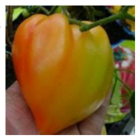
TM98-20 - Orange Strawberry Tomato

85 days. Solanum lycopersicum. Open Pollinated. The plant produces good yields of 1 to 2 lb bi-colored yellow-orange tomatoes with streaks of red. These heart-shaped tomatoes are very delicious, meaty, and have few seeds. Perfect for salads, garnishes, or culinary creations. It is a cross between Russian 117 and Georgia Streak. An excellent choice for home gardens. A variety from Russia. Indeterminate.