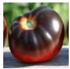
TM877-20 - Blush Tomato Seeds

75 days. Solanum lycopersicum. Open Pollinated. Blue Streaks Tomato. The plant produces good yields of red tomatoes with a bluish crown. Perfect for sandwiches, salads, and slicing. An excellent choice for home gardens. Indeterminate. A variety from the USA.