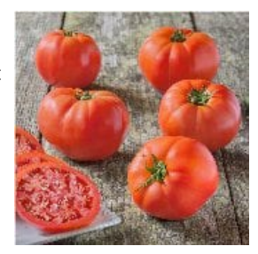
TM702-10 - Russian 117 Tomato Seeds

75 days. Solanum lycopersicum. (F1) The plant produces high yields of 6 to 8 oz red tomatoes. They are very sweet, meaty, juicy, with exceptional flavor. Perfect for salads, slicing, burgers, and sandwiches. Suitable for containers, patios, or small gardens where space is very limited! One of the most disease-resistant tomato varieties. An excellent choice for home gardens, farmer's markets, and market growers. Disease Resistant: V, FF, N, St, LB, TMV. Determinate.