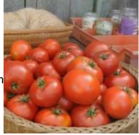
TM402-20 - Marianna's Peace Tomato

85 days. Solanum lycopersicum. Open Pollinated. The plant produces high yields of huge 16 oz globe-shaped tomatoes. The flavor is just incredible. They have a rich tomato taste and are very sweet. Perfect for fresh eating, sandwiches, and salads. The plant is so productive you can harvest 17.6 lbs of tomatoes from one plant! An excellent choice for home gardens and Farmer's Markets. A variety from Maria Nagy of Turda, Romania. Indeterminate.