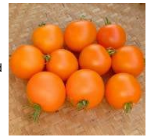
TM844-10 - Sungold Select Tomato Seeds

70 days. Solanum lycopersicum. Open Pollinated. Sungella Tomato. This early maturing plant produces high yields of 2 oz orange tomatoes. They are very sweet, juicy, and flavorful. Perfect for salads, salsas, sauces, drying, garnishes, or culinary creations. Cold Tolerant. Low acidity variety. This is the dehybridized version. Suitable for greenhouse production. Always a great seller at Farmer's Markets! An excellent choice for home gardens, greenhouses, and market growers. Indeterminate.