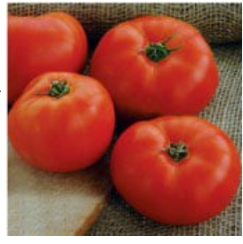
TM726-20 - Mountain Gold Tomato

72 days. Solanum lycopersicum. (F1) This early maturing plant produces heavy yields of 10 to 12 oz red tomatoes. Perfect for salads, slicing, and sandwiches. This variety has increased firmness that will hold up during shipping. These high-quality tomatoes are used for commercial production. To maximize yield potential, either stake or use cages. Excellent choice for home gardens, market growers, and open field production. A variety was developed by NC State University at the Mountain Research and Extension Center in Fletcher, NC, USA. Disease Resistant: V, FFF, TSWV. Determinate. (Pelleted Seeds)