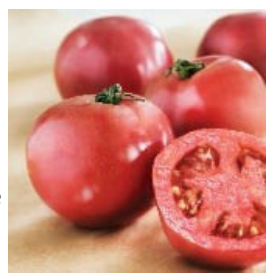
TM386-20 - Trophy Tomato Seeds

78 days. Solanum lycopersicum. Open Pollinated. The plant produces high yields of 6 to 8 oz dark pink tomatoes. They are very sweet, meaty, juicy, and flavorful. Perfect for sandwiches, salads, slicing, and canning. One of the best-tasting pink tomatoes. It is much earlier and more dependable than the Brandywine tomato. Crack-Resistant. Heat and humidity tolerant. An excellent choice for home gardens. The Arkansas Traveler version was developed in 1971. Later in 1976, the Traveler 76 heirloom version was developed by Joe McFerran at the University of Arkansas Horticulture Department, Arkansas, USA. Indeterminate.