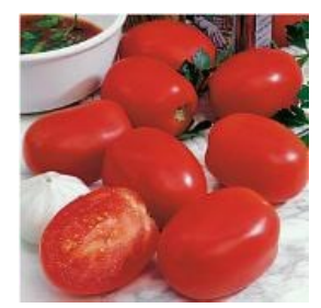
TM624-20 - Polar Baby Tomato

68 days. Solanum lycopersicum. (F1) Plum Dandy Tomato. This early maturing plant produces high yields of red plum-shaped tomatoes. They are firm, very sweet, and very flavorful. A quality paste and saladette tomato. Grows in clusters. Excellent choice for home gardens and market growers. Disease Resistant: EB. Indeterminate.