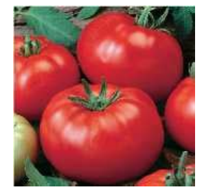
TM485-20 - Grandeur Tomato Seeds

72 days. Solanum lycopersicum. (F1) Grandaddy Tomato. This early maturing plant produces good yields of 10 to 16 oz brilliant red tomatoes. They are very sweet, meaty, juicy, and flavorful. Perfect for sandwiches, hamburgers, salads, and slicing. These blue ribbon prize winning tomatoes will be the topic of conversation when guests sit down to eat. One of the best quality giant beefsteak tomatoes available anywhere! Suitable for container gardening. An excellent choice for home gardens. Disease Resistant: V, F. Determinate.