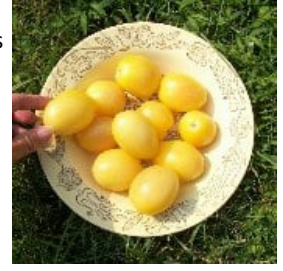
TM342-20 - Olena Ukrainian Tomato Seeds

80 days. Solanum lycopersicum. Open Pollinated. The plant produces good yields 2 to 3 oz of egg-shaped tomatoes. A very interesting tomato. It has the color, shape, and size of a chicken egg. They turn from ivory to creamy yellow. They have a mild flavor. Perfect for salads, garnishes, or culinary creations. Also known as Australian Yellow Plum Tomato. Excellent choice for home gardens. An heirloom variety from Australia. Indeterminate.