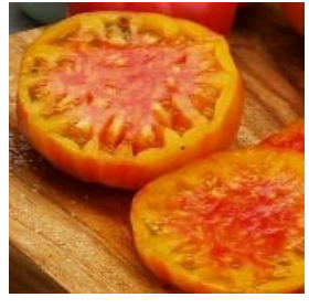
TM282-10 - Viva Italia Tomato Seeds

80 days. Solanum lycopersicum. Open Pollinated. The plant produces high yields of 1 to 2 lb bi-colored golden yellow beefsteak tomatoes with red stripes that turn into a ruby blush on top. It has a rich full tomato flavor. One of the best tasting, most beautiful, and best producing bi-colored tomatoes. Perfect for salads, slicing, sandwiches, and culinary creations. An excellent choice for home gardens. An heirloom variety from Virginia, USA. Indeterminate.