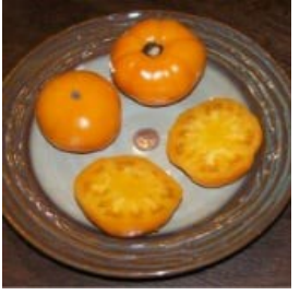
TM22-20 - Brandywine Yellow Tomato Seeds

85 days. Solanum lycopersicum. Open Pollinated. Brandywine Yellow Platfoot Strain Tomato. The plant produces high yields of 1 to 2 lb yellow beefsteak tomatoes. It has a rich old fashioned tomato flavor. Perfect for sandwiches, salads, and slicing. It has higher yields and a smoother shape than the Yellow Brandywine Tomato. One of the best tasting yellow tomatoes on the market. A potato leaf strain. An excellent choice for home gardens. A 1996 heirloom variety was developed by Gary Platfoot of Ohio, USA. Indeterminate.