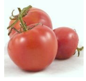
TM922-10 - Lucky Tiger Tomato

78 days. Solanum lycopersicum. Open Pollinated. The plant produces excellent yields of 6 to 8 oz pink tomatoes. They are is smooth and very flavorful. A good all-around tomato. Perfect for sandwiches, salads, slicing, and canning. An old market variety that has proven itself for generations. Suitable for the Gulf states as well as other parts of the country. It excels in the Southern states where high heat and humidity are common during the summer. Low acid tomato. Crack-Resistant. Heat-Resistant. Humidity Tolerant. An excellent choice for home gardens and market growers. Louisiana Gulf State is an improved Gulf State Market Tomato. An heirloom variety from Louisiana, USA. Indeterminate.