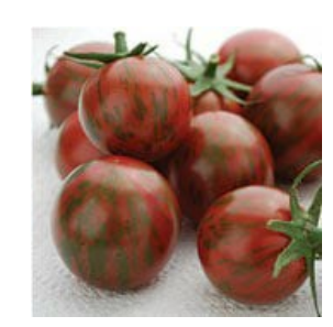
TM331-20 - Purple Calabash Tomato

70 days. Solanum lycopersicum. Open Pollinated. Purple Bumble Bee Tomato. This early maturing plant produces high yields of 1 to 2 oz purplish-red cherry tomatoes with green stripes. They are very sweet and flavorful. Perfect for salads, garnishes, or culinary creations. An Artisan Series variety. Suitable for hydroponics gardening. Crack Resistant. Excellent choice for home gardens. Indeterminate.