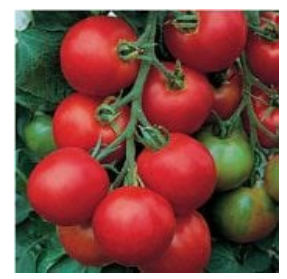
TM499-20 - Ananas Noir Tomato

80 days. Solanum lycopersicum. Open Pollinated. The plant produces high yields of 1 to 2 oz dark pink cherry tomatoes. They are very sweet, firm, and flavorful. Perfect for salads, snacks, sauces, and drying. The cherry tomatoes last almost forever on the vines without rotting. Grows in clusters from 4 to 6. An excellent choice for home gardens and market growers. Indeterminate.