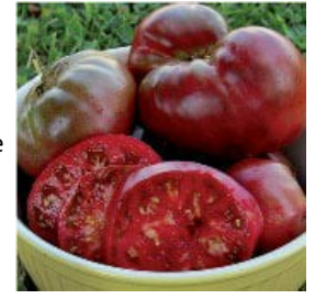
TM847-20 - Black Opal Tomato Seeds

80 days. Solanum lycopersicum. Open Pollinated. Black Krim Tomato. The plant produces high yields of 10 to 16 oz dark mahogany, blackish-red beefsteak tomatoes. It has a rich old fashioned tomato flavor. They are very sweet, juicy, and flavorful. Perfect for sandwiches, salads, and slicing. Heat Tolerant. Suitable for containers and patio gardening. An excellent choice for home gardens. An heirloom from the Black Sea region of Russia. Indeterminate.