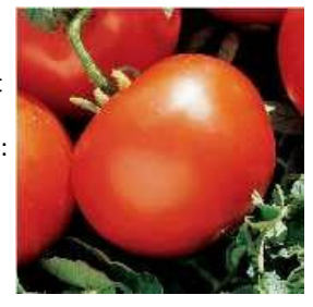
TM209-20 - Marglobe Supreme Tomato

75 days. Solanum lycopersicum. Open Pollinated. The plant produces high yields of red tomatoes. They are very sweet, have thick walls, and are flavorful. Perfect for salads, slicing, sandwiches, and canning. An excellent choice for home gardens. United States Department of Agriculture, NSL 53698. Disease Resistant: V, F, A. Determinate