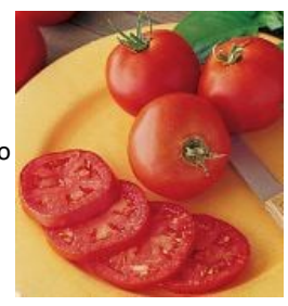
TM692-10 - Earl's Faux Tomato Seeds

85 days. Solanum lycopersicum. Open Pollinated. The plant produces heavy yields of 4 to 8 oz deep red mini beefsteak tomatoes. This variety has superb flavor. We've never seen such a beautiful heirloom tomato that is perfectly formed, pure red, and smooth-skinned! Perfect for sandwiches, burgers, salads, and slicing. Also known as Drushba and Druzhba. Grows in clusters of 2 to 4. Crack Resistant. Always a great seller at Farmer's Markets! Excellent choice for home gardens and market growers. An heirloom variety from Bulgaria. United States Department of Agriculture, PI 407445. Disease Resistant. BER. Indeterminate.