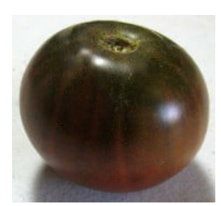
TM939-20 - Blue Ribbon Tomato Seeds

78 days. Solanum lycopersicum. Open Pollinated. The plant produces good yields of 8 to 10 oz purplish-gray blue tomatoes. They have a robust sweet flavor. Perfect for sandwiches, salads, and slicing. A potato leaf variety. Excellent choice for home gardens. Indeterminate.