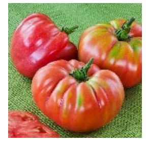
TM49-20 - German Red Strawberry Tomato Seeds

80 days. Solanum lycopersicum. Open Pollinated. German Queen Tomato. The plant produces good yields of 1 to 2 lb pink beefsteak tomatoes. They are very sweet, meaty, and flavorful. It has a rich old fashioned tomato flavor. Perfect for sandwiches, salads, and slicing. A potato leaf variety. Suitable for hydroponics gardening. The plant requires support, either staking or cages. An excellent choice for home gardens. An heirloom variety from Germany. Indeterminate.