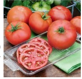
TM59-10 - Heatwave II Tomato Seeds

75 days. Solanum lycopersicum. (F1) Heatmaster Tomato. The plant produces high yields of 7 oz deep red tomatoes. Perfect for sandwiches, salads, and slicing. A great storage variety. The plant has the ability to set fruit under higher temperatures than other varieties. Developed for the hot climate of the Southeast. One of the most disease resistant tomato varieties. Heat Tolerant. An excellent choice for home gardens and market growers. Disease Resistant: V, FF, N, A, St, ToMV. Determinate.