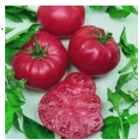
TM206-20 - Wayahead Tomato Seeds

75 days. Solanum lycopersicum. Open Pollinated. Watermelon Beefsteak Tomato. The plant produces high yields of 1 to 2 lb pink beefsteak tomatoes. They are very sweet, meaty, juicy, and flavorful. It has a rich old-fashioned tomato flavor. Perfect for salads, slicing, and sandwiches. A plant can produce up to 50 lbs of tomatoes. An excellent choice for home gardens. An heirloom variety from West Virginia dating back to the 1800s. Indeterminate.