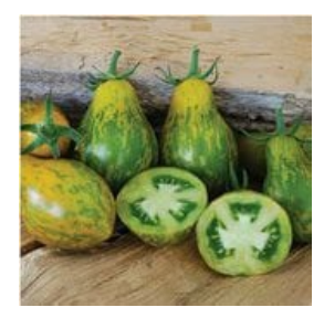
TM621-10 - Momotaro Tomato Seeds

75 days. Solanum lycopersicum. Open Pollinated. Mint Julep Tomato. The plant produces high yields of 1 ½ to 4 oz bicolored chartreuse green pear shaped tomatoes with bright yellow stripes. They have a pleasant tomato taste with a nice sweet overall flavor. Perfect for salads, garnishes, or culinary creations. A variation of the Green Zebra Tomato. Also known as the Michael Pollan Tomato. A Wild Boar Series tomato. The plant produces huge yields, up to 5 gallons from one plant! Excellent choice for home gardens. Indeterminate.