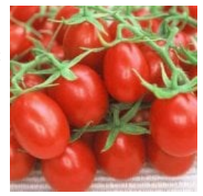
TM932-20 - Grappoli d'Inverno Tomato Seeds

75 days. Solanum lycopersicum. (F1) The plant produces high yields of \frac{1}{2} to \frac{3}{4} oz red grape tomatoes. They are very sweet and flavorful. Perfect fresh eating right off the vine or in salads. Grow in clusters of 16 to 40. They are very easy to pick. An excellent choice for home gardens. Disease Resistant: F. Determinate.