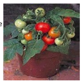
TM778-20 - Mini Orange Tomato Seeds

88 days. Solanum lycopersicum. (F1) The plant produces good yields of small red tomatoes. Ideal for house plants, window boxes, containers, and patios. Kids love them! Developed by the University of Florida. Determinate.