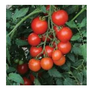
TM856-10 - Mountain Majesty Tomato Seeds

70 days. Solanum lycopersicum. (F1) Mountain Magic Tomato. This early maturing plant produces high yields of large 2 oz bright red cherry tomatoes. They are very sweet and flavorful. Perfect fresh eating right off the vine or in salads. They are known as Campari tomatoes and command high prices at specialty markets and supermarkets. The tomatoes hold well on the plant and hold up very well after harvest. Grows in clusters of 7 to 8. Crack Resistant. An excellent choice for home gardens, farmer's markets, market growers, open production, and commercial production. Disease Resistant: V, FFF, A, EB, LB. Indeterminate. (Pelleted Seeds)