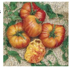
TM605-10 - Big Raspberry Tomato

85 days. Solanum lycopersicum. Open Pollinated. The plant produces good yields of 1 to 2 lb bi-colored beefsteak tomatoes. They have a fruity sweet flavor and turn to golden yellow and red when mature. The yellow tomato has neon red streaking through the flesh. Perfect for salads and garnishes. Crack Resistant. Excellent choice for home gardens. A family heirloom variety from Germany. Indeterminate.