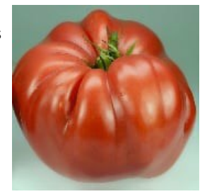
TM690-20 - Italian Sweet Tomato

85 days. Solanum lycopersicum. Open Pollinated. The plant produces high yields of 1 lb deep red beefsteak tomatoes. They are very sweet, meaty, juicy, and flavorful. Perfect for salads, sandwiches, salsas, sauces, and Italian dishes. The plant requires support, either staking or cages. An excellent choice for home gardens. An heirloom variety from Italy was brought to the USA over 80 years ago. Indeterminate.