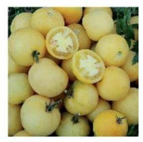
TM139-20 - Washington Cherry Tomato Seeds

78 days. Solanum lycopersicum. Open Pollinated. Wapsipinicon Peach Tomato. The plant produces heavy yields of 2 to 3 oz creamy-yellow, almost white, tomatoes that are fuzzy like a peach. They are sweet and very flavorful. Perfect for salads, garnishes, or culinary creations. One of the best-tasting tomatoes. It has won many tomato taste tests with its fruity sweet flavor. Also known as Yellow Peach Tomato and White Peach Tomato. An excellent choice for home gardens. An 1890 heirloom variety from the Wapsipinicon River area, Iowa, USA. Indeterminate.