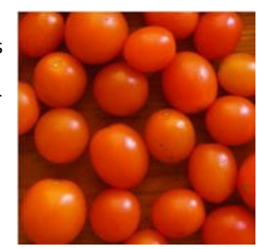
TM99-20 - Oregon Spring Tomato

58 days. Solanum lycopersicum. (F1) Early maturing plant produces heavy yields of ½ to ¾ oz bright orange cherry tomatoes. They are firm, sweet, and very flavorful. Perfect fresh eating right off the vine or in salads. Excellent choice for home gardens and market growers. Disease Resistant: V, F. Indeterminate.