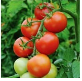
TM547-20 - Moonglow Tomato Seeds

75 days. Solanum lycopersicum. Open Pollinated. Moneymaker Tomato. The plant produces heavy yields of 4 to 6 oz bright red tomatoes. They are very sweet, juicy, and flavorful. Perfect for salads, slicing, and sandwiches. This variety does well in hot and humid climates. Suitable for greenhouse production. An excellent choice for home gardens. An heirloom variety from Bristol, England, UK, dating back to the early 1900s. United States Department of Agriculture, PI 286255. Indeterminate.