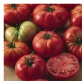
TM697-20 - Chapman Tomato

65 days. Solanum lycopersicum. (F1) This early maturing plant produces high yields of 6 to 8 oz red tomatoes. Perfect for sandwiches, salads, and slicing. It has the same desirable qualities and flavor as the original Champion Tomato with even more disease resistance. Heat Tolerant. Excellent choice for home gardens and market growers. Disease Resistant: V, FF, N, A, TMV, TYLCV. Indeterminate.