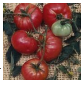
TM632-10 - Clint Eastwood Rowdy Red Tomato

85 days. Solanum lycopersicum. Open Pollinated. Climbing Trip L Crop Tomato. The plant produces enormous yields of large 12 to 24 oz red tomatoes. They are very meaty with very few seeds making them perfect for canning. Also great for sandwiches, salads, and slicing. Produces 2 to 3 bushels of tomatoes per plant. Vines grow from 10 to 15 feet long. Also known as the Italian Tree Tomato. The plant requires support, either staking or cages. A potato leaf variety. Suitable for greenhouse production. An excellent choice for home gardens and a greenhouse. An heirloom variety. United States Department of Agriculture, PI 644741. Indeterminate.