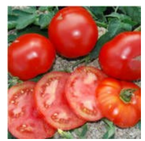
TM70-20 - Jubilee Tomato Seeds

75 days. Solanum lycopersicum. Open Pollinated. Plant produces high yields of 5 oz bright red tomatoes. They are very meaty and flavorful. Perfect for sandwiches, burgers, salads, slicing, and canning. Crack resistant. Excellent choice for home gardens and market growers. A 1914 heirloom variety from Mr. John Baer of Baltimore County, Maryland, USA. United States Department of Agriculture, PI 270192. Indeterminate.