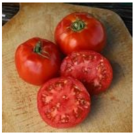
TM278-20 - Jetsetter Tomato Seeds

72 days. Solanum lycopersicum. (F1) Jet Star Tomato. This early maturing plant produces tremendous yields of 7 to 9 oz red tomatoes. They are meaty and very flavorful. Perfect for salads, sandwiches, and canning. In tests, it had the highest yield of total marketable and premium quality tomatoes averaging 100 tomatoes per plant. It is also rated as the top greenhouse tomato. Suitable for commercial growers. Low acidity variety. Crack Resistant. A fresh market and plant sales favorite. To maximize yield potential, either stake or use cages. An excellent choice for home gardens, greenhouses, market growers, and open field production. Disease Resistant: V, F. Indeterminate.