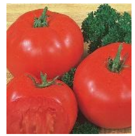
TM253-10 - Super Bush Tomato

80 days. Solanum lycopersicum. Open Pollinated. Super Beefsteak Tomato. The plant produces high yields of 17 oz red beefsteak tomatoes. It has a rich full tomato flavor. Perfect for sandwiches, burgers, salads, and slicing. Crack Resistant. An excellent choice for home gardens and market growers. Disease Resistant: V, F, N. Indeterminate.