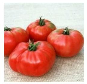
TM707-10 - Santa Clara Canner Tomato

85 days. Solanum lycopersicum. Open Pollinated. Sandul Moldovan Tomato. The plant produces high yields of 1 lb red beefsteak tomatoes. What makes this tomato so special is its exceptional flavor. It has a high sugar and high acid balance. Perfect for salads, slicing, and sandwiches. Excellent choice for home gardens. An heirloom variety from the Sandul family of Moldova. Indeterminate.