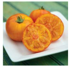
TM384-10 - Ultimate Opener Tomato Seeds

65 days. Solanum lycopersicum. (F1) Tye-Dye Orange Tomato. This early maturing plant produces high yields of 7 oz bi-colored bright yellow-orange tomatoes with a blush of red both inside and outside. They are mildly sweet and flavorful. Perfect for salads, garnishes, or culinary creations. An excellent choice for home gardens. Disease Resistant: V, F, A. Indeterminate.