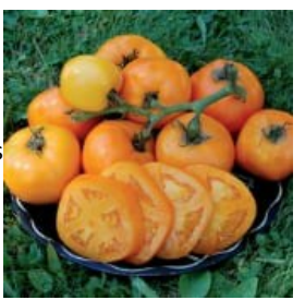
TM82-20 - Mortgage Lifter Tomato Seeds

85 days. Solanum lycopersicum. Open Pollinated. Moonglow Tomato. The plant produces high yields of 6 to 8 oz bright orange tomatoes. They are very sweet, meaty, and very flavorful. It is considered by many tomato lovers, as the best texture and flavor of an orange tomato. Great for adding color and taste to salads and gourmet dishes. It has a good shelf life. An excellent choice for home gardens. An heirloom variety. Indeterminate.