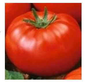
TM192-20 - Watermelon Beefsteak Tomato Seeds

75 days. Solanum lycopersicum. Walter Tomato. The plant produces high yields of 8 oz red tomatoes. They are very flavorful. A low acid variety does well in the Southern regions. Excellent for salads, slicing, and sandwiches. Excellent choice for home gardens, farmer's markets, and market growers. An heirloom variety from Gisborne, New Zealand. Indeterminate.