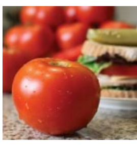
TM916-10 - Celebrity Supreme Tomato Seeds

70 days. Solanum lycopersicum. (F1) Celebrity Plus Tomato. This early maturing plant produces heavy yields of 7 to 10 oz bright red tomatoes. They grow in clusters and are smooth, firm, meaty, and very flavorful. The Celebrity Plus Tomato has the characteristics of the Celebrity Tomato but with improved disease resistance. Perfect for sandwiches, salads, and slicing. Also great for making tomato juice and tomato sauce. Suitable for canning and freezing too! The Celebrity tomato plant is as close to perfect as you can get! One of the most disease resistant tomato varieties. The plant has strong vines and does extremely well in most regions. Crack Resistant. To maximize yield potential, either stake or use cages. An excellent choice for home gardens and market growers. Disease Resistant: V, FF, N, T, A, St, TMV, TSWV. Semi-Determinate.