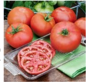
TM59-10 - Heatwave II Tomato Seeds

75 days. Solanum lycopersicum. (F1) Heatmaster Tomato. The plant produces high yields of 7 oz deep red tomatoes. Perfect for sandwiches, salads, and slicing. A great storage variety. The plant has the ability to set fruit under higher temperatures than other varieties. Developed for the hot climate of the Southeast. One of the most disease resistant tomato varieties. Heat Tolerant. An excellent choice for home gardens and market growers. Disease Resistant: V, FF, N, A, St, ToMV. Determinate.