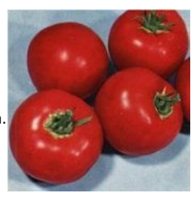
TM522-10 - Shady Lady Tomato Seeds

60 days. Solanum lycopersicum. Open Pollinated. Scotia Tomato. This early maturing plant produces high yields of 4 oz bright red tomatoes. They are sweet and flavorful. Perfect for sandwiches, salads, slicing, salsas, sauces, tomato juice, and canning. Cold Tolerant. Excellent choice for home gardens. A variety was developed by the Dominion Experiment Farm, Kentville, Nova Scotia, Canada. United States Department of Agriculture, PI 279817. Determinate.