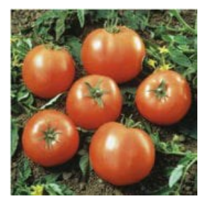
TM589-20 - Goliath Tomato Seeds

70 days. Solanum lycopersicum. (F1) Goliath Prime Beef Tomato. This early maturing plant produces good yields of 10 oz red beefsteak tomatoes. They are sweet and very flavorful. Perfect for salads, slicing, and sandwiches. Excellent choice for home gardens and market growers. A variety from the USA. Disease Resistant: V, FF, St, TMV. Indeterminate.