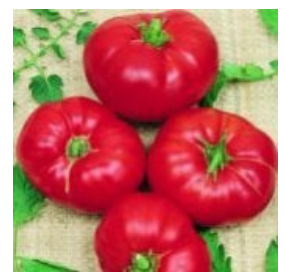
TM942-10 - Boy-Oh-Boy Tomato Seeds

80 days. Solanum lycopersicum. Open Pollinated. Box Car Willie Tomato. The plant produces heavy yields of 10 to 16 oz red tomatoes. It has a rich old-fashioned tomato flavor. Perfect for canning, freezing, sauces, salads, sandwiches, slicing, tomato juice, or for making home-cooked meals. Thought to have been named after the legendary country singer Box Car Willie of the Grand Ole Opry. Crack Resistant. An excellent choice for home gardens. An heirloom variety from the USA. Indeterminate.