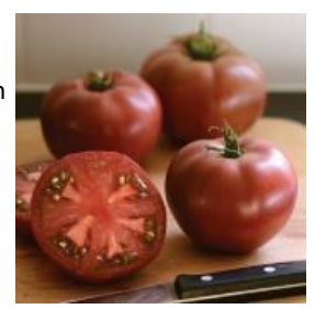
TM748-10 - Cherokee Chocolate Tomato Seeds

78 days. Solanum lycopersicum. Open Pollinated. Cherokee Carbon Tomato. The plant produces high yields of 10 to 12 oz purple beefsteak tomatoes. It has a rich old-fashioned tomato flavor and is very sweet. It has improved yield, earlier maturity, and fewer blemishes while maintaining old-time flavor. Perfect for sandwiches, salads, and slicing. It is a cross between Cherokee Purple and Carbon. Crack Resistant. Indeterminate.