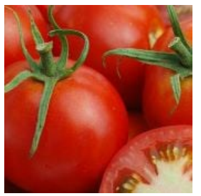
TM255-10 - Comstock Sauce & Slice Tomato

76 days. Solanum lycopersicum. (F1) Plant produces good yields of 7 to 8 oz red tomatoes. They are firm and very flavorful. Perfect for sandwiches, salads, and slicing. Excellent choice for home gardens and market growers. Disease Resistant: V, FF, A, St. Determinate.