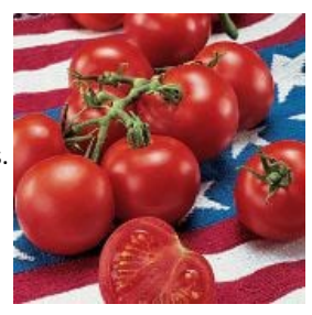
TM936-10 - Galahad Tomato

49 days. Solanum lycopersicum. (F1) Fourth of July Tomato. This extra early maturing plant produces high yields of 4 oz bright red tomatoes. Perfect for sandwiches, salads, and slicing. They are very flavorful. You can celebrate these tomatoes by the Fourth of July. Heat Tolerant. Excellent choice for home gardens. Indeterminate. A variety from the USA.