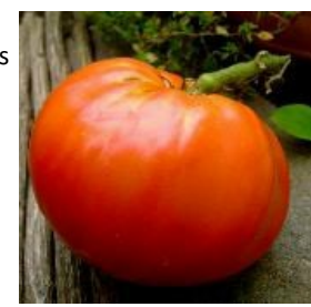
TM123-20 - Siberian Tomato Seeds

80 days. Solanum lycopersicum. Open Pollinated. The plant produces good yields of 12 to 16 oz red heart-shaped tomatoes. They are solid, juicy, and delicious. Perfect for salads, slicing, sandwiches, and making rich tomato sauce. Excellent choice for home gardens. An heirloom variety. Indeterminate.