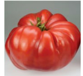
TM532-20 - German Head Tomato

77 days. Solanum lycopersicum. Open Pollinated. German Giant Tomato. The plant produces good yields of 1 to 2 lb deep pink tomatoes. They are smooth in shape and are very flavorful, similar to the Brandywine varieties. Perfect for sandwiches, salads, and slicing. A potato leaf variety. An excellent choice for home gardens. A rare heirloom variety from Germany. Indeterminate.