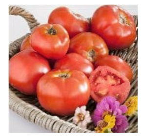
TM720-10 - Marizol Gold Tomato Seeds

75 days. Solanum lycopersicum. Open Pollinated. Marion Tomato. The plant produces high yields of 6 to 8 oz red tomatoes. Perfect for salads, slicing, and sandwiches. A Rutgers-type tomato, but earlier, larger, and more disease-resistant. Crack Resistant. The plant requires support, either staking or cages. Suitable for the Southeast region. An excellent choice for home gardens and market growers. An heirloom variety was developed by the USDA Vegetable Station in Charleston, South Carolina, USA in 1960. United States Department of Agriculture, PI 309668. Disease Resistant: F, A, St. Indeterminate.