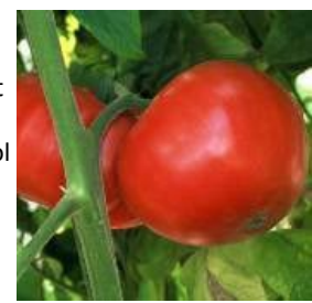
TM331-20 - Purple Calabash Tomato Seeds

75 days. Solanum lycopersicum. Open Pollinated. Purple Brandy Tomato. The plant produces good yields of 8 to 16 oz deep pink purple beefsteak tomatoes. It has a rich tomato flavor as fine as the Brandywine tomato. Perfect for salads, slicing, and sandwiches. This is a cross between the Brandywine and the Marizol Purple. A potato leaf variety. Also known as Purple Brandywine Tomato, Marizol Brandywine Tomato, and Marizol Bratka Tomato. Excellent choice for home gardens. An heirloom variety. Indeterminate.