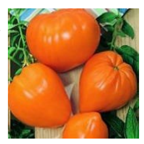
TM99-20 - Oregon Spring Tomato

75 days. Solanum lycopersicum. Open Pollinated. The plant produces high yields of 8 to 16 oz deep orange tomatoes. They have a meaty, rich tomato taste, and very few seeds. One of the most perfect heart shapes of any tomato variety known. Perfect for salads, slicing, sandwiches, garnishes, canning, sauce, or culinary creations. An excellent choice for home gardens. An heirloom variety from the USA. United States Department of Agriculture, G 33040. Indeterminate.