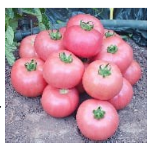
TM751-20 - Celebration Tomato Seeds

80 days. Solanum lycopersicum. Open Pollinated. Caspian Pink Tomato. The plant produces excellent yields of large 10 to 12 oz pink beefsteak tomatoes. One of the best tasting tomatoes on the market. The first tomato to beat Brandywine in taste tests. The Caspian Pink beat the Brandywine varieties in three straight taste tests. Perfect for sandwiches, salads, and slicing. The plant requires support, either staking or cages. An excellent choice for home gardens. An heirloom variety from the Caspian and Black Sea region of Russia. Indeterminate.