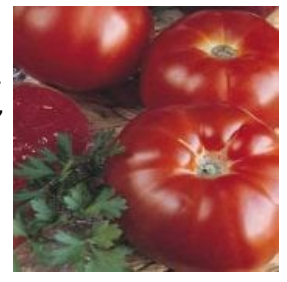
TM543-20 - Super Sioux Tomato

68 days. Solanum lycopersicum. Open Pollinated. Super Marmande Tomato. This early maturing plant produces high yields of 10 to 16 oz red beefsteak tomatoes. They are very sweet, meaty, juicy, and flavorful. Perfect for sandwiches, burgers, salads, slicing, and canning. An excellent choice for home gardens. An heirloom from France. Disease Resistant: V, F, A. Semi-Determinate.