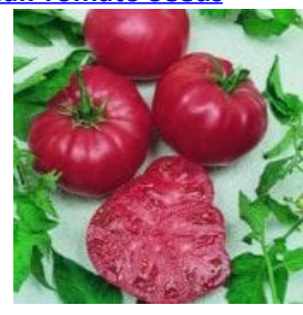
75 days. Solanum

lycopersicum. Open Pollinated. Watermelon Beefsteak Tomato. The plant produces high yields of 1 to 2 lb pink beefsteak tomatoes. They are very sweet, meaty, juicy, and flavorful. It has a rich old-fashioned tomato flavor. Perfect for salads, slicing, and sandwiches. A plant can produce up to 50 lbs of tomatoes. An excellent choice for home gardens. An heirloom variety from West Virginia dating back to the 1800s. Indeterminate.