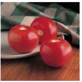
TM17-20 - Bonny Best Tomato

68 days. Solanum lycopersicum. (F1) Bobcat Tomato. This early maturing plant produces high yields of 10 oz shiny red tomatoes. Great tomato flavor with the right balance of sugars and acids. They have smooth skin and are very sweet, meaty, and juicy. Perfect for sandwiches, salads, and slicing. It is a sister of the Better Bush Tomato. The plant has dense foliage that provides excellent protection to the fruit. Suitable for large patio containers. An excellent choice for home gardens, farmer's markets, market growers, open production, and commercial production. Disease Resistant: F, FF, V, St, TMV. Determinate.