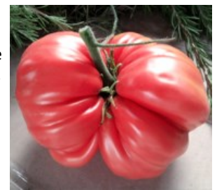
TM630-10 - Siletz Tomato Seeds

75 days. Solanum lycopersicum. Open Pollinated. Sicilian Saucer Tomato. The plant produces good yields of 2 to 3 lb red giant beefsteak tomatoes. They are very sweet, meaty, juicy, and flavorful. Perfect for salads, slicing, sandwiches, and making sauces. Try growing the biggest tomato you will ever see! The plant requires support, either staking or cages. An excellent choice for home gardens. An heirloom variety from Sicily, Italy. Indeterminate.