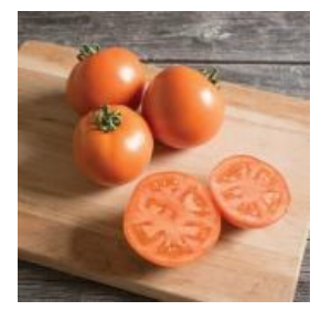
TM915-10 - Big Beef Plus Tomato Seeds

74 days. Solanum lycopersicum. (F1) This early maturing plant produces high yields of 10 to 12 oz orange tomatoes. This tomato has true orange color inside. It has less acid than most red tomatoes. Perfect for sandwiches, salads, slicing, and gourmet dishes. Excellent choice for home gardens and specialty market growers. Disease Resistant: FF, FCRR, TMV, V. Determinate.