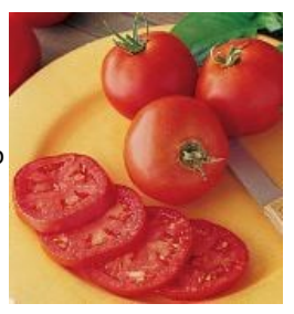
TM692-10 - Earl's Faux Tomato Seeds

85 days. Solanum lycopersicum. Open Pollinated. The plant produces heavy yields of 4 to 8 oz deep red mini beefsteak tomatoes. This variety has superb flavor. We've never seen such a beautiful heirloom tomato that is perfectly formed, pure red, and smooth-skinned! Perfect for sandwiches, burgers, salads, and slicing. Also known as Drushba and Druzhba. Grows in clusters of 2 to 4. Crack Resistant. Always a great seller at Farmer's Markets! Excellent choice for home gardens and market growers. An heirloom variety from Bulgaria. United States Department of Agriculture, PI 407445. Disease Resistant. BER. Indeterminate.