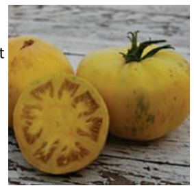
TM343-20 - Pineapple Tomato Seeds

75 days. Solanum lycopersicum. Open Pollinated. The plant produces excellent yields of 14 to 16 oz bi-colored creamy yellow tomatoes with pink stripes. Perfect for salads, garnishes, or culinary creations. A Wild Boar Series variety. Low acidity variety. Excellent choice for home gardens. Indeterminate.