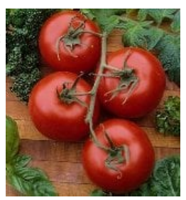
TM118-20 - Rutgers Tomato Seeds

78 days. Solanum lycopersicum. Open Pollinated. Rutgers Select Tomato. The plant produces heavy yields of 5 to 8 oz red tomatoes. They are sweet and very flavorful. Perfect for salads, slicing, sandwiches, sauce, paste, and canning. An excellent choice for home gardens, market growers, and open field production. An heirloom variety developed at Rutgers University, New Jersey, USA, in the 1920s. United States Department of Agriculture, PI 645198. Disease Resistant. V, F, A, St. Indeterminate.