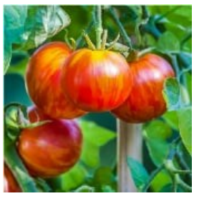
TM676-10 - Todd County Amish Tomato Seeds

55 days. Solanum lycopersicum. Open Pollinated. Tigerella Tomato. This early maturing plant produces high yields of 2 to 4 oz bicolored bright red tomatoes with orange stripes. They are meaty, juicy, and have a rich tangy flavor. One of the finest preferred supermarket tomatoes around. The plant requires support, either staking or cages. Suitable for both greenhouse and open field production. An excellent choice for home gardens, farmer's markets, market growers, greenhouses, open production, and commercial production. An heirloom variety developed by Dr. Lewis Darby of the United Kingdom Glasshouse Crops Research Institute. Indeterminate.