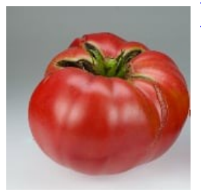
TM645-10 - Booty Tomato Seeds

80 days. Solanum lycopersicum. Open Pollinated. The plant produces high yields of 1 to 2 lb deep pink beefsteak tomatoes. It has a superb, rich flavor, high in both sugar and acid. They are similar to the Brandywine Tomato. Perfect for sandwiches, salads, and slicing. A potato leaf variety. Excellent choice for home gardens. An heirloom variety from New York, USA. Indeterminate.