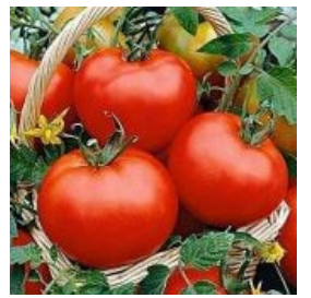
TM486-10 - Florida 47 Tomato Seeds

85 days. Solanum lycopersicum. Open Pollinated. The plant produces good yields of 6 oz red tomatoes. Perfect for sandwiches, salads, and slicing. Good shipping variety. Crack Resistant. Does well in humid regions. An excellent choice for home gardens and market growers. United States Department of Agriculture, PI 645214. Disease Resistant: F. Indeterminate.